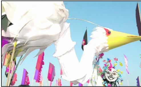
■ A colourful entrant taking part in the procession at Womad festival in Reading